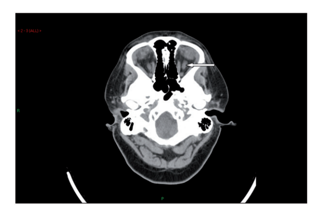
FIGURE 2 Initial CT head showing optic nerve sheath distension (arrow).

malignant hypertension was made and the optic nerve swelling was attributed to this. Ramipril, amlodipine, and doxazosin were commenced to treat the hypertension. A computed tomography (CT) brain was reported as normal, but on review of images retrospectively it showed evidence of optic nerve sheath swelling bilaterally (Figure 2). Magnetic resonance imaging (MRI) of the heart and MR angiogram of aorta and renal arteries were normal. Serum aldosterone was 1121 pmol/L (normal range: 100-400 pmol/L) and renin was raised at 95 mlU/L (normal range: up to 40 mIU/L). These results were compatible with secondary hyperaldosteronism caused by reduced renal perfusion from systemic vasoconstriction (in primary hyperaldosteronism plasma renin is suppressed). No secondary cause for her hypertension was identified.