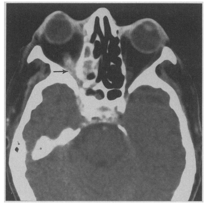
Fig 1.—Computed axial tomogram of the orbits demonstrating right-sided ethmoidal and sphenoidal sinusitis with extension into the orbital apex. There is some bony erosion in the posterior portion of the laminae papyraceae.